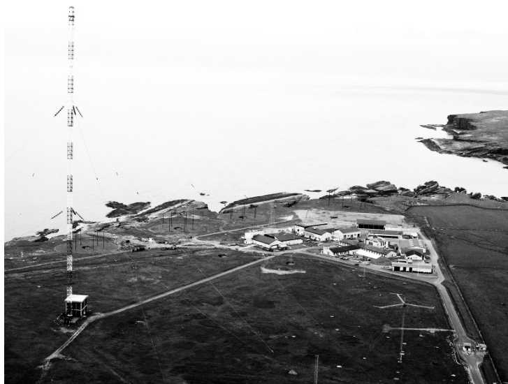
Figure 3: Aerial view of transmitter site at Forss. 1 June 1986.

The Exchange sold a limited range of US goods and merchandise, while the Commissary had US groceries and drinks. However, sailors and their families bought most of their groceries and goods in the local community [2, 4].