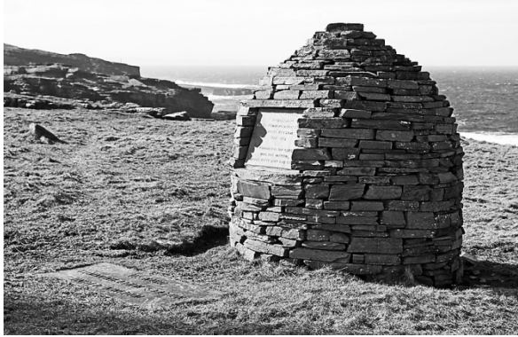
Figure 4: Commemorative stone cairn at Forss site. 13 March 2014.

The cairn's inscription states; "Here once stood United States Naval Communication Station, United Kingdom. 1962–1992. Supporting the fleet was our mission, world peace was our goal." It is reported to contain a time capsule [4].