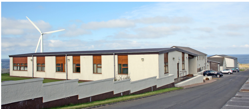
Figure 5: Forss Business and Technology Park office units. 9 September 2013.

The FBTP has been successful over its 11 year life. However, there has been uncertainty generated with the owners going into administration in 2013, due to lender issues resulting from the UK financial crisis. The site currently (2014) has 12 tenants supporting around 150 jobs, plus nine people employed to manage and maintain the Park. The property services company Graham and Sibbald now manage FBTP for the administrators and has advertised it by offering a range of flexible office and industrial accommodation for lease or rent, along with a refectory and a full on-site management service. There are 13 buildings with unit space ranging from 8 to 594 sq. m (fig. 5) [17].