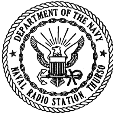
Figure 1: NAVRADSTA Thurso crest.

The mission was to operate, maintain and manage those facilities, equipment and systems necessary to provide requisite communications for the command, control and administration of the naval establishment and defence communications system. The station provided a wide range of voice, telex and satellite services.