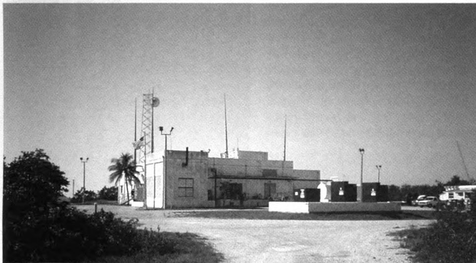
Clockwise from left: Sailors pictured in Tech Control in 1977 (note the facial hair). The newly constructed transmitter site at Saddlebunch Key as it looked in 1969, and as it appears today. Naval Communication Station Key West maintains and operates communication guard centers in support of Commander Key West Forces, Commander Naval Base, Commander Fleet Air Squadron and other components of local naval activities.

In 1992, NAVCOMMU Key West was decommissioned and became a Government Owned/Contractor Operated detachment under NCTAMS LANT until 2000, when it was realigned as a Detachment under NAVCOMTELSTA Jacksonville. Key West continues to adapt to the realities of the shifting naval communications environment. A recent reduced scope of the GOCO contract has enabled them to consolidate operations and management into a single building.