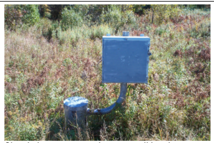
Clam Lake antenna earth return well head

Based on the success of this previous ground terminal upgrade work, the Navy anticipates replacing the other existing grounds for the antenna at the Clam Lake site in the next several years. In conjunction with these