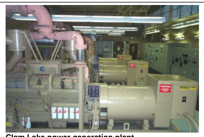
Clam Lake power generation plant

The Navy estimates the local economic impact of the Clam Lake facility to be approximately $6,000,000 annually. The Clam Lake facility, is staffed by two NCTAMS LANT civil service employees and about 30 contractor employees. The facility spends about $2,000,000 per year in employee payroll and local supplies and services (FY2000). The site staff operates the transmitter facility, conducts maintenance on the equipment and antenna system, and maintains the antenna right of way. The facility purchases services and supplies such as electricity, trash removal, fuel for vehicles and generators, office supplies and materials locally. The Navy spends about $400,000 annually on electricity purchased from the local Wisconsin power utility. When the local Wisconsin utilities experience near peak electrical demand, the Naval transmitter facility can bring as many as three Cummins diesel