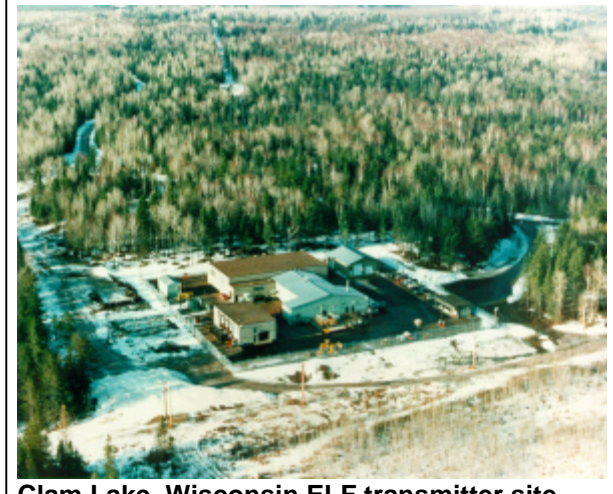
Clam Lake, Wisconsin ELF transmitter site

The U.S. Navy operates two extremely low frequency radio transmitters to communicate with its deep diving submarines. The sites at Clam Lake, Wisconsin and Republic, Michigan are operated by the Naval Computer and Telecommunications Area Master Station – Atlantic. The Clam Lake site, located in the Chequamegon National Forest in Northern Wisconsin, is the site where testing began for ELF communications more than 30 years ago. The site has more than 28 miles of over-head signal transmission line that form part of the "electrical" antenna to radiate the ELF signal from the two-acre transmitting facility.